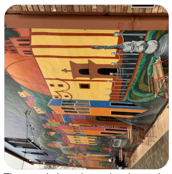
The mural along the pedestrian path