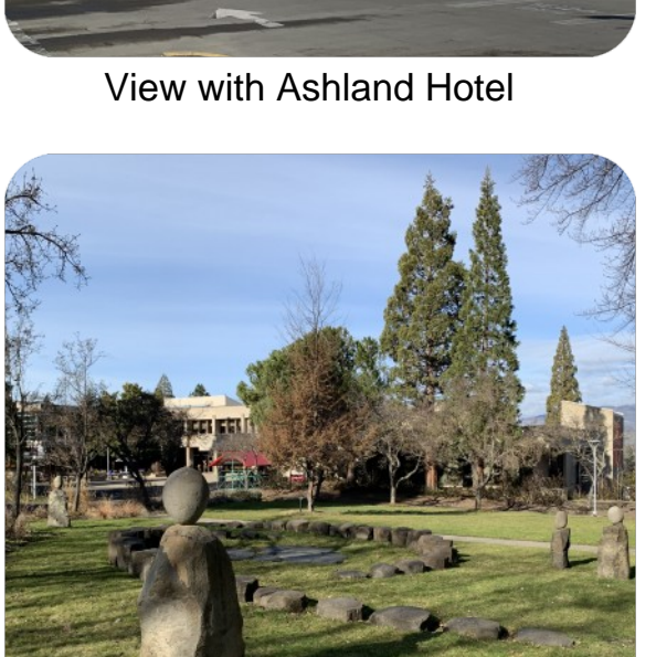
At Southern OR University