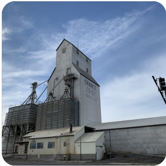
The Central Point Grange Co-Op