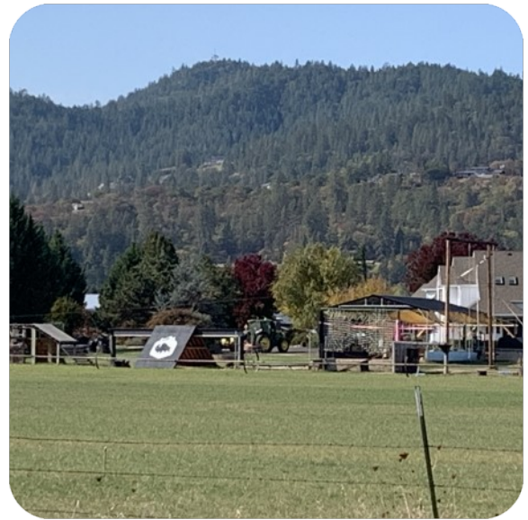
A view from a rural road on this walk