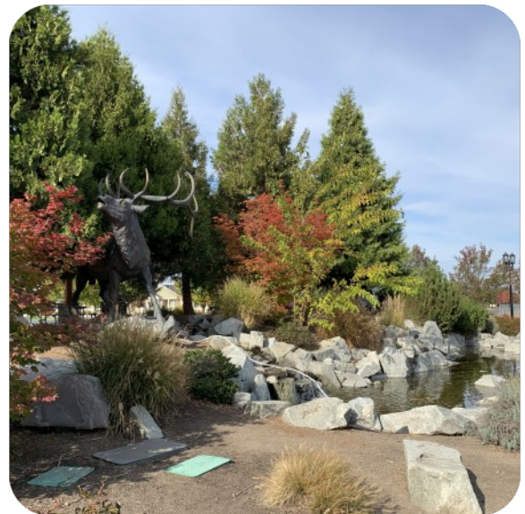
Showcase entry to twin creeks Park area