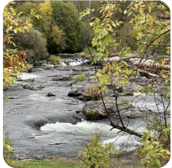
A view of the Rogue River