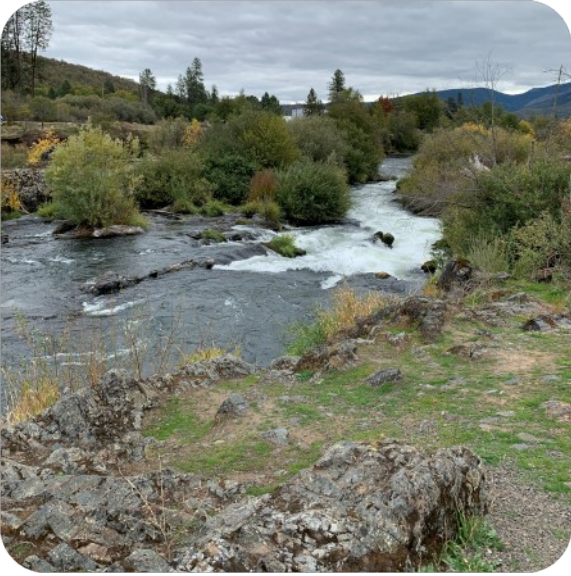
Part of the Falls area of the Rogue River