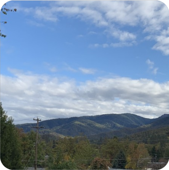
View of the hills nearby