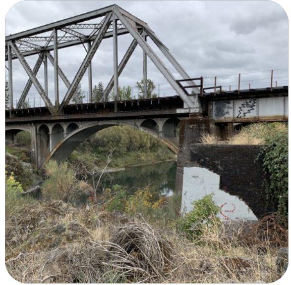
The train trestle over the Rogue River